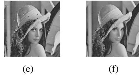
Fig1. Simulation results of different filter (a) Original image (b) noisy image with 80% impulse noise (c) output for PSM filter (d) output of ASM filter (e) output for min-max filter (f) output for proposed algorithm

In the simulation, the effectiveness of the proposed method is demonstrated by real processing results with gray scale image lena.png, (see table 1 & 2), with their dynamic range of values [0, 255]. In the part of image restoration, we use adaptive switching median filter [ASMF][6] algorithm. Here, four different methods (1) The Progressive switching median filter [PSM filter] [9], (2) Adaptive Switching Median Filter [ASM filter] [6], (3) Min-Max (with window 3x3) filter [7] and (4) proposed method are compared in terms of quantitative measurement (miss-detection [M], false-detection [F] and PSNR). For qualitative analysis, performance of the filters is tested at different levels of noise densities, and the results are shown in Fig 1. In the proposed method, the size of the structuring element g is chosen as 5 \times 5 , while T is predefined as 30. For other compared filters, relevant parameters are tuned to achieve the best restoration results. The PSNR values for the proposed method and the other compared filters are shown in table 2. From the Table 2, it can be seen that proposed method produces higher PSNR values than other filters.